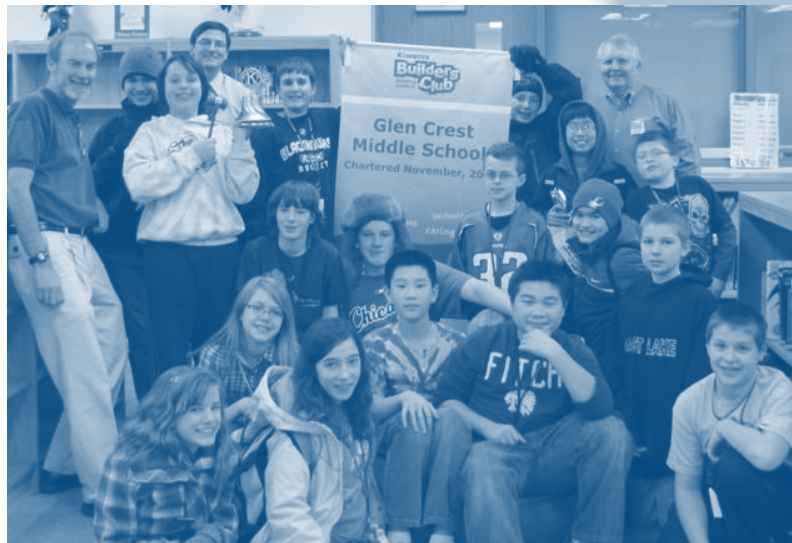
The Glen Crest Builders Club is sponsored by the Kiwanis Club.