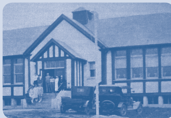
In 1920, Wagner School became part of Community Consolidated School District 89 school when Districts 39 and 40 merged.

District 89 is celebrating a significant date of origin and history. Community Consolidated School District was formed in 1920 with the merger of Districts 39 and 40, making 2015 the 95th year as a consolidated school district. Through the 95 years of existence, CCSD89 has prospered and grown to the exceptional level of excellence we appreciate today. Our community can continue to be proud of our dedicated teaching staff and the high level of achievement students have earned.